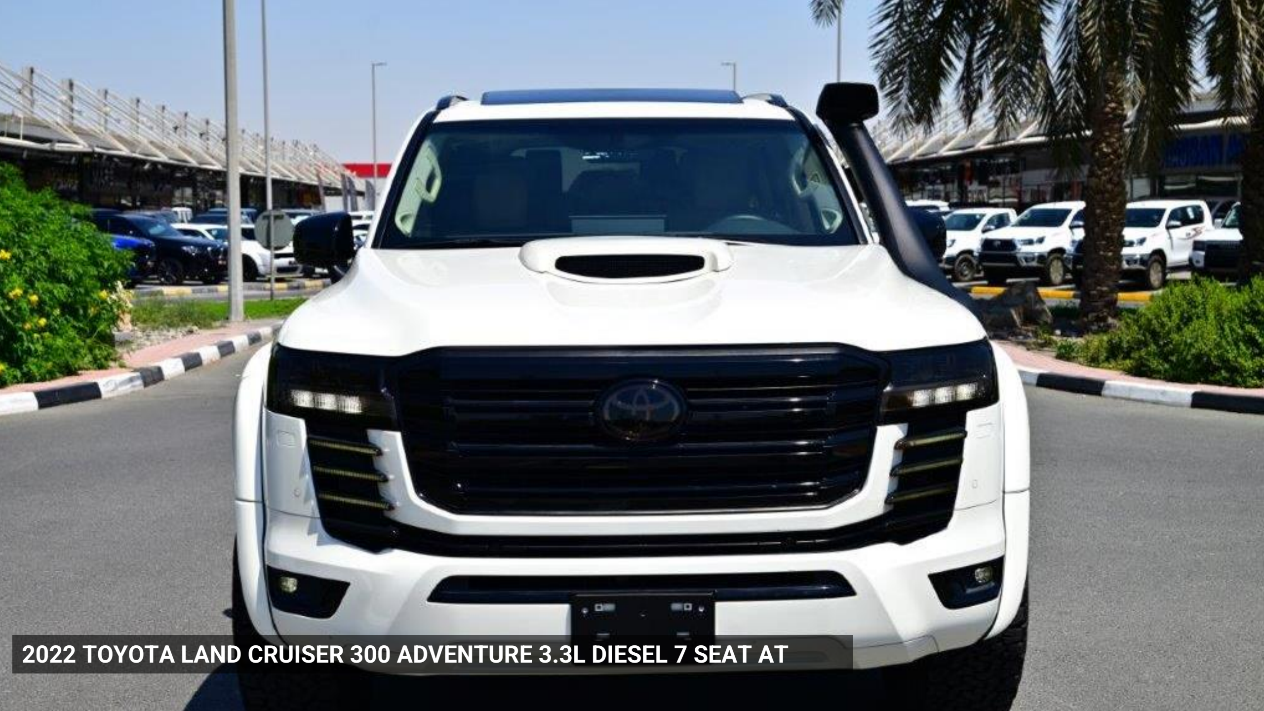
2022 TOYOTA LAND CRUISER 300 ADVENTURE 3.3L DIESEL 7 SEAT AT