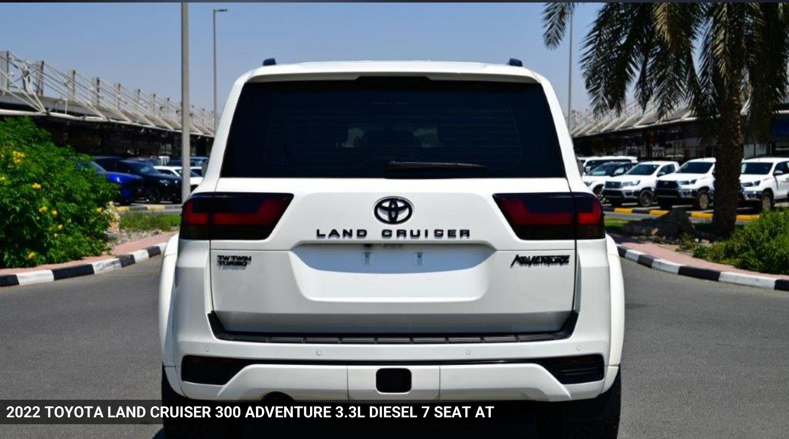
2022 TOYOTA LAND CRUISER 300 ADVENTURE 3.3L DIESEL 7 SEAT AT