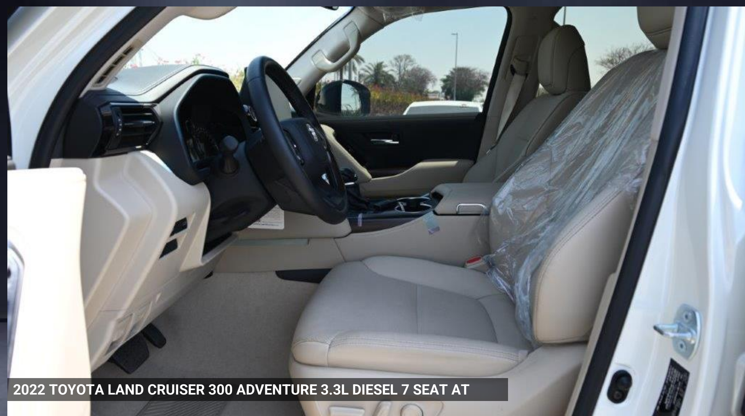
2022 TOYOTA LAND CRUISER 300 ADVENTURE 3.3L DIESEL 7 SEAT AT