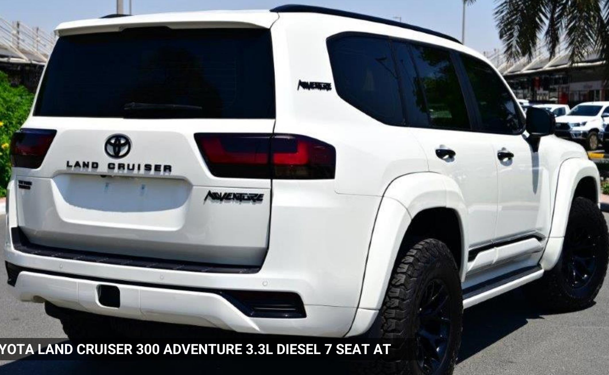
2022 TOYOTA LAND CRUISER 300 ADVENTURE 3.3L DIESEL 7 SEAT AT