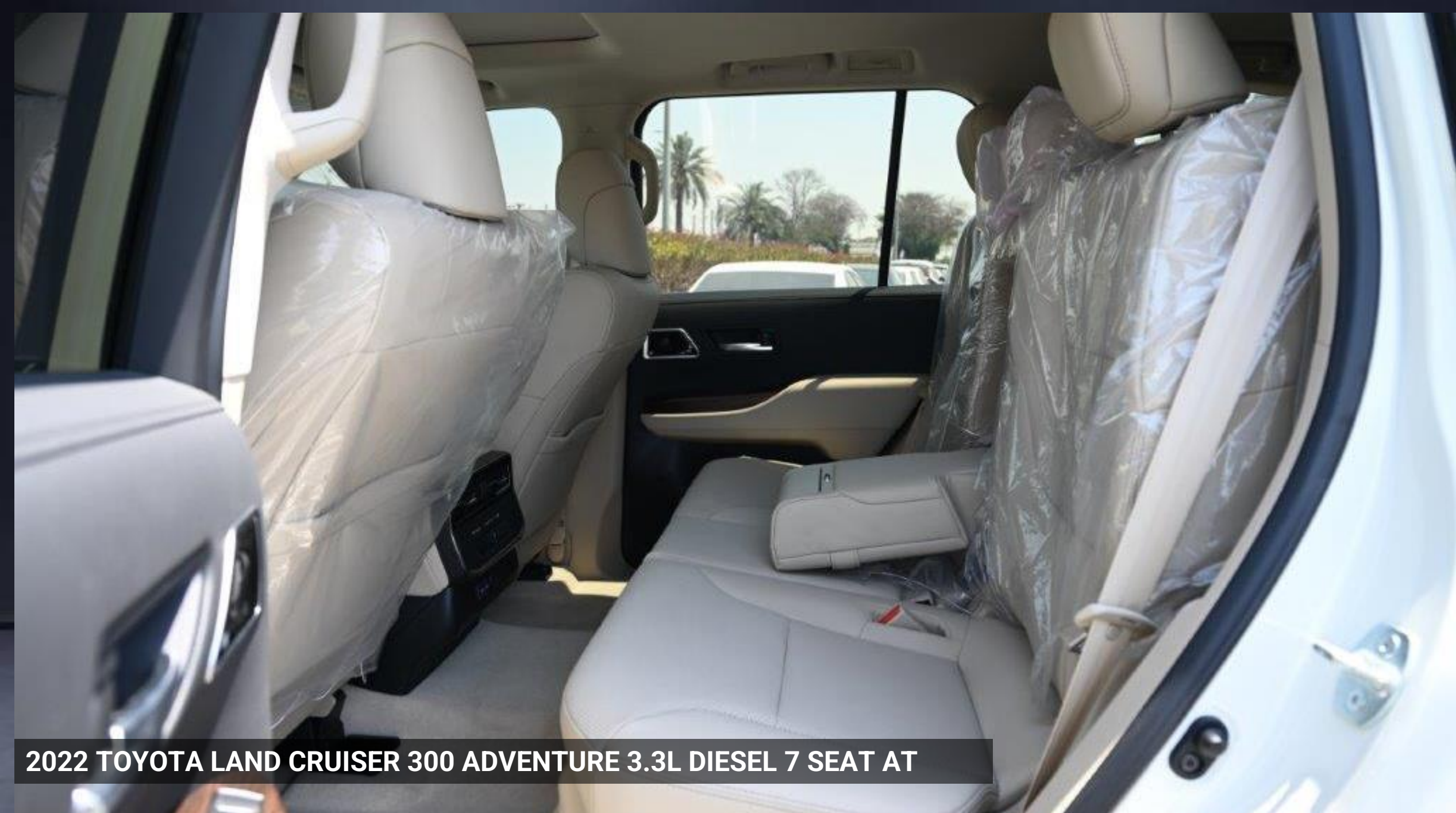
2022 TOYOTA LAND CRUISER 300 ADVENTURE 3.3L DIESEL 7 SEAT AT