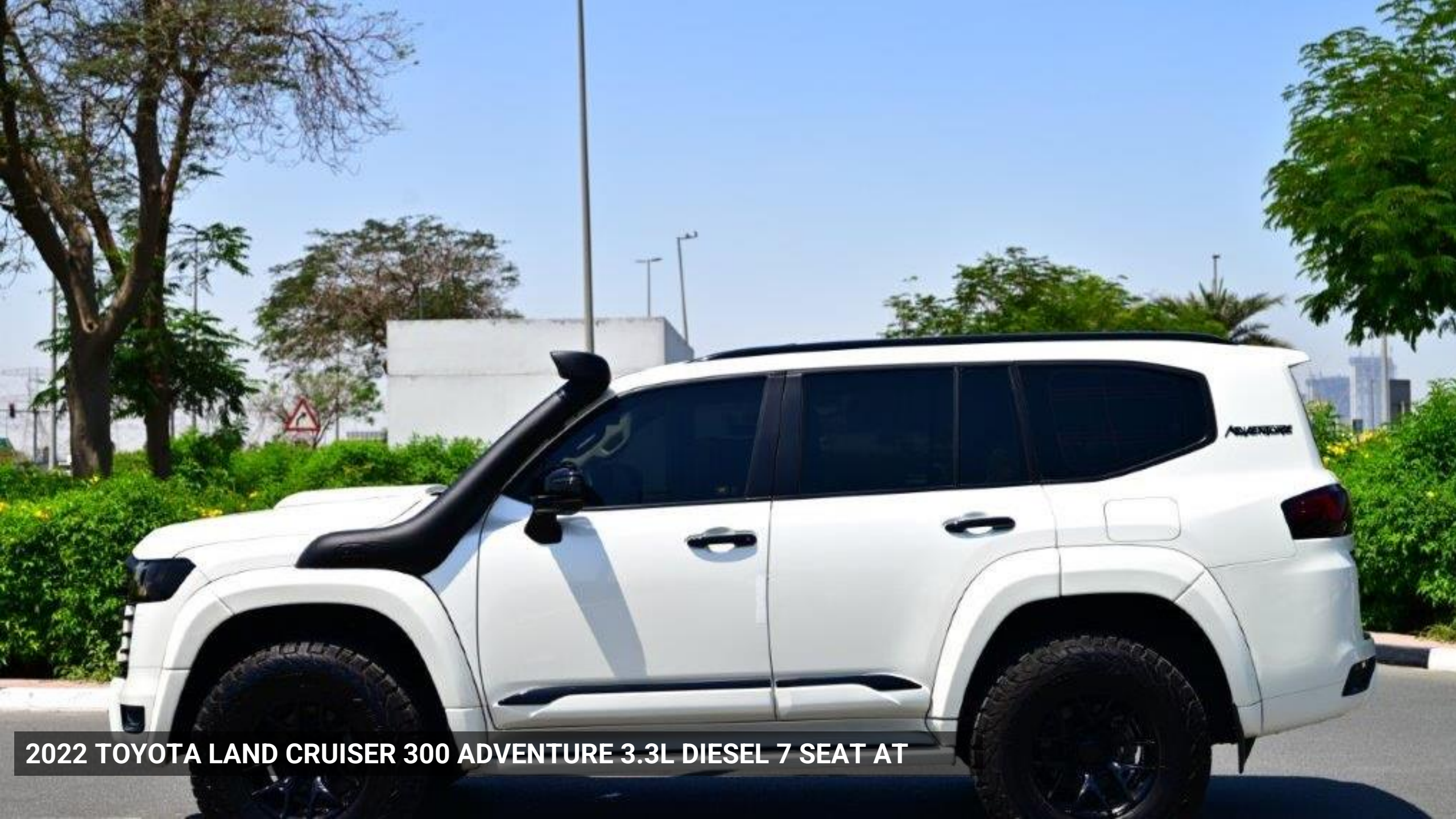
2022 TOYOTA LAND CRUISER 300 ADVENTURE 3.3L DIESEL 7 SEAT AT