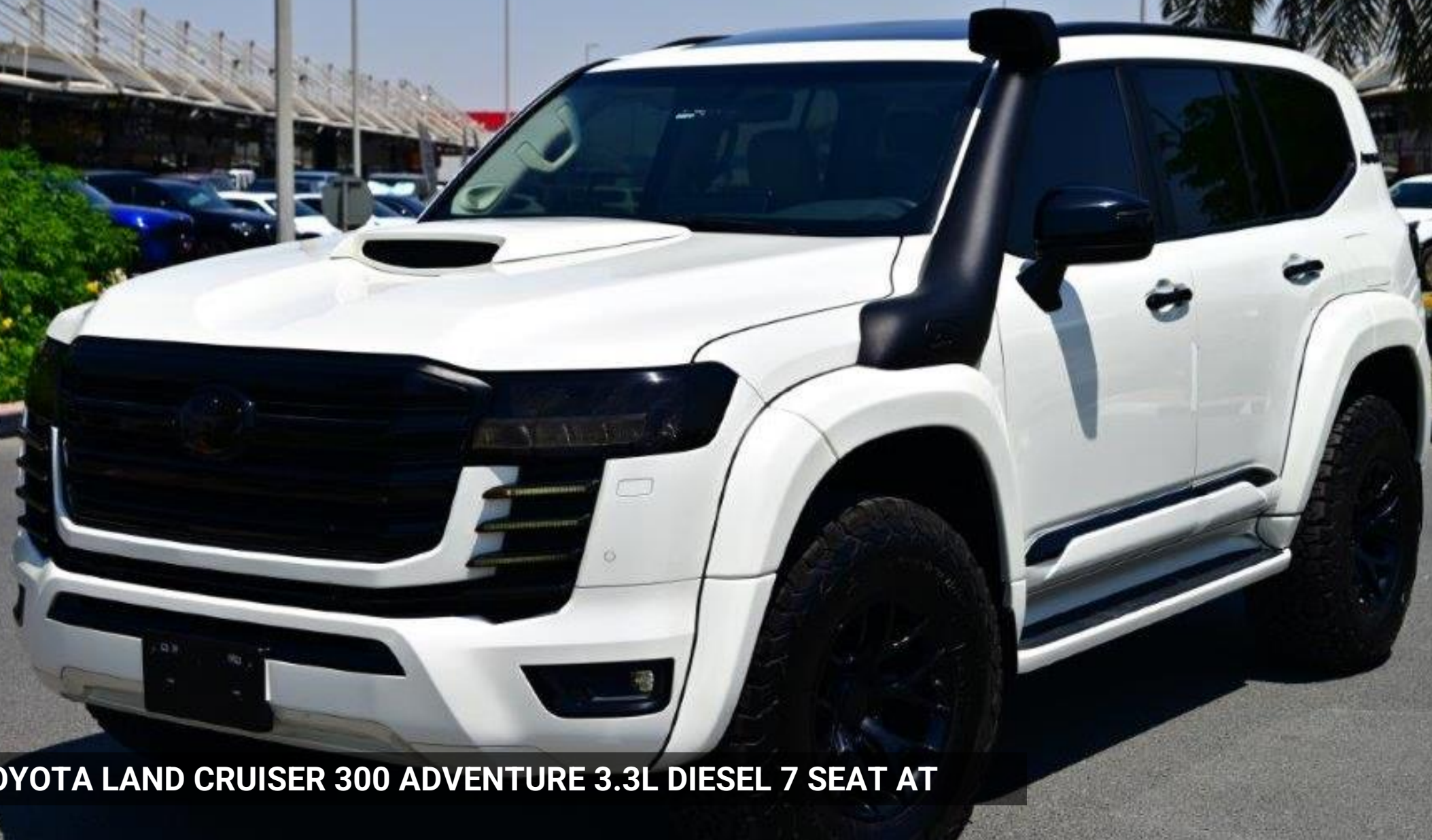
2022 TOYOTA LAND CRUISER 300 ADVENTURE 3.3L DIESEL 7 SEAT AT